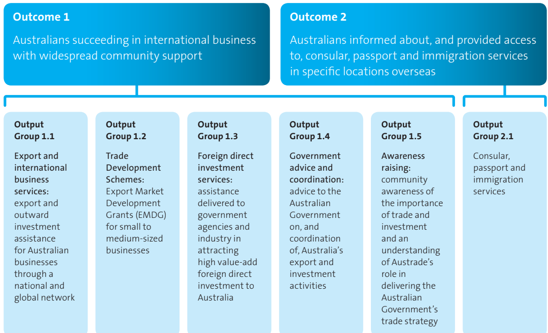
Figure 2: Austrade's outcome and output framework for 2008–09

From 1 July 2009, Austrade's reporting will be presented on a program basis following the Government's Operation Sunlight Outcome Statements Review.