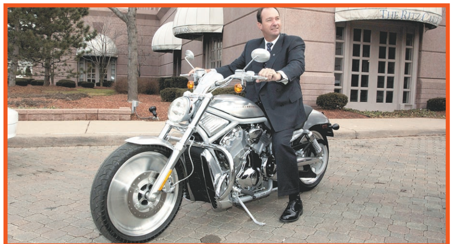
Mark Vaile, Federal Minister for Trade, on a Harley V Rod with Castalloy wheels and hubs.

The South Australian firm, Castalloy makes wheels for the Harley-Davidson, one of the world's most famous motorcycles, and has a contract with them until 2010. Castalloy is the light metal casting division of Ion Automotive and also provides components to Ford, Holden, Peugeot, Proton and Mitsubishi. www.castalloy.com.au