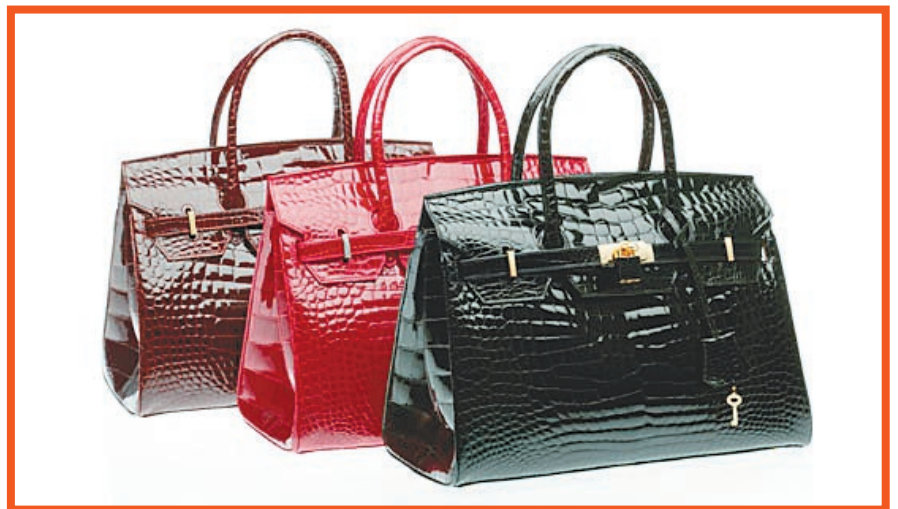
Di CROCO handbags.

Australian Crocodile Products designs and manufactures a range of handbags, belts, purses and other accessories under the di CROCO brand. The collection is made exclusively from farmed saltwater crocodile skins from the Northern Territory and since 1998, the business has exported more than $500,000 of its high end accessories to the USA and Europe. austcrocodile@bigpond.com