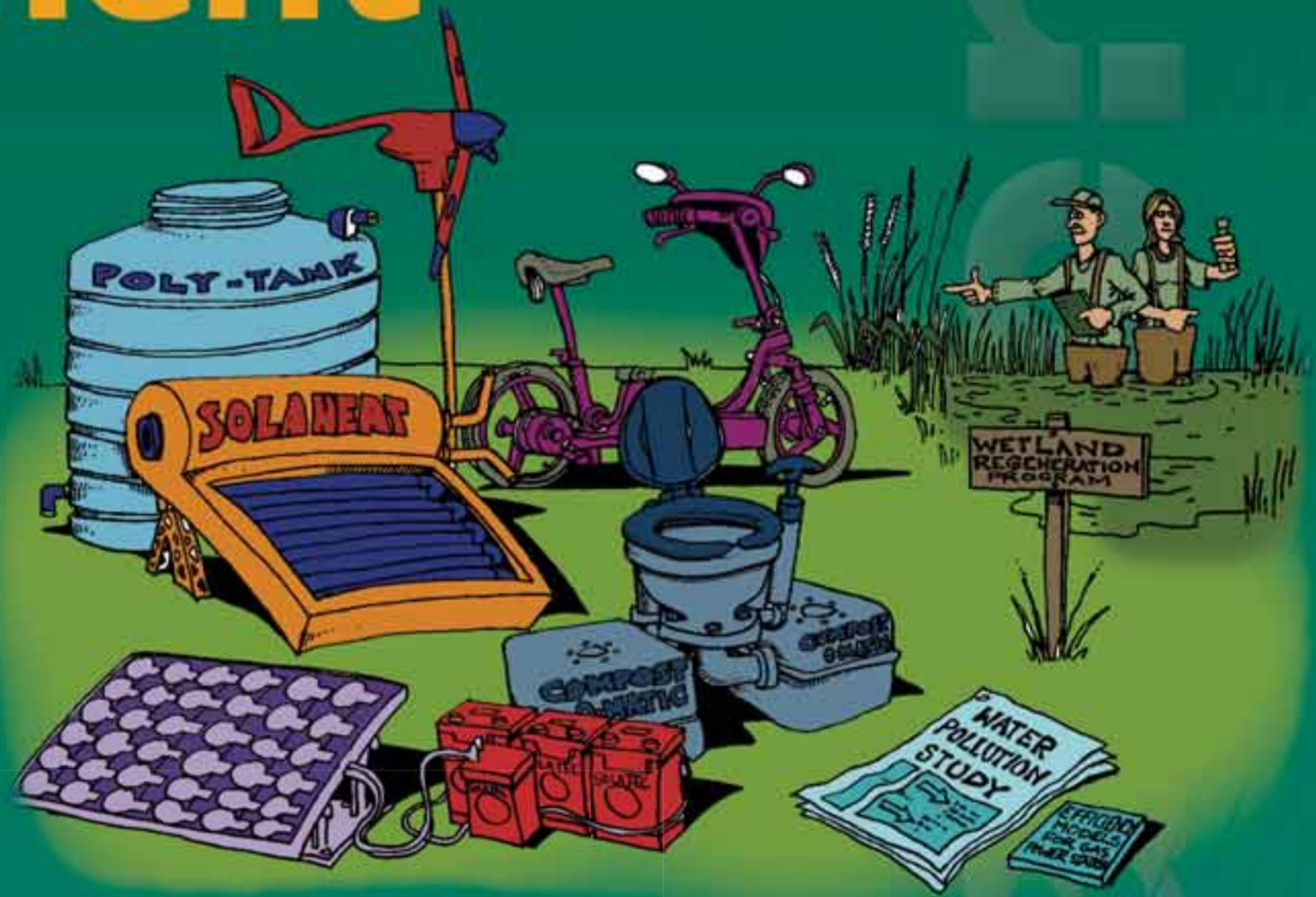
Environmental protection is linked to prosperity

Rapid economic growth can strain the environment, but as incomes rise, consumers demand environmental protection policies