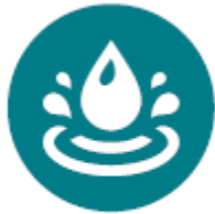
PROBLEM 1 – ACCESS TO CLEAN WATER