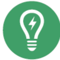
PROBLEM 2 – GENERATING OFF-GRID ENERGY